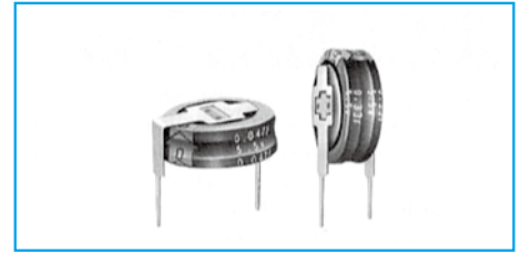
Marking color : White print on an indigo sleeve